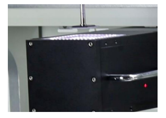
CCD optical align lens