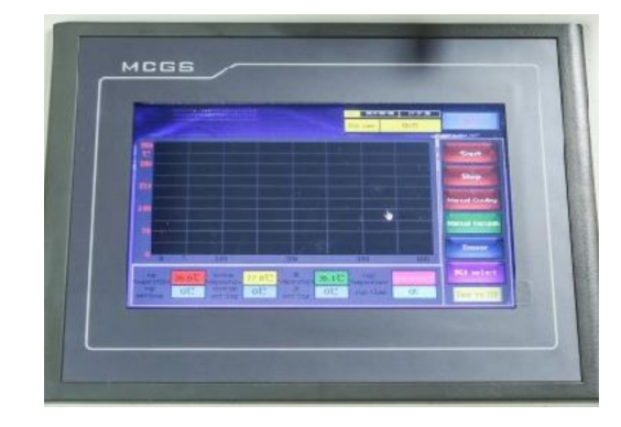
Touch screen control